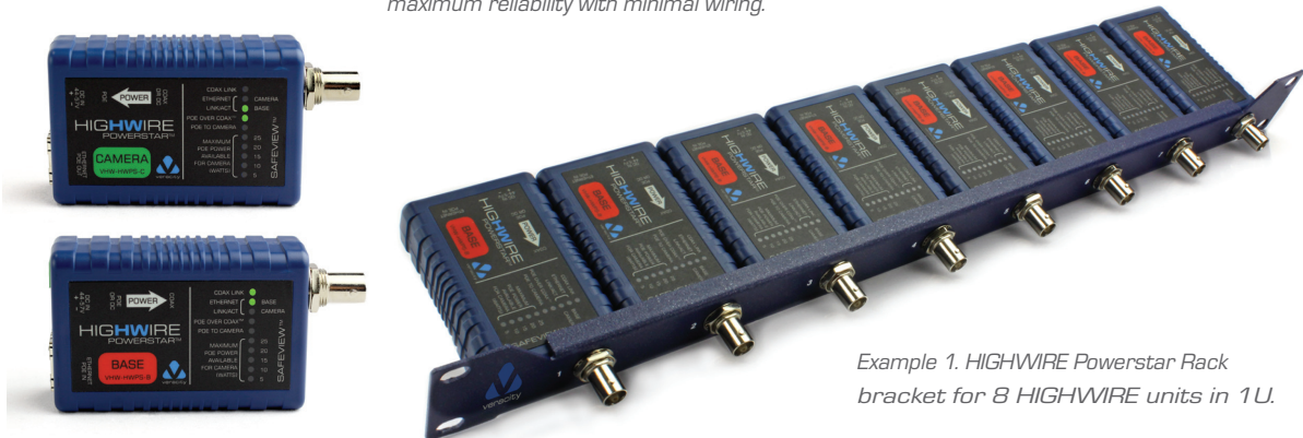
Example 1. HIGHWIRE Powerstar Rack bracket for 8 HIGHWIRE units in 1U.